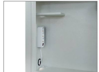
Lockable media cabinet