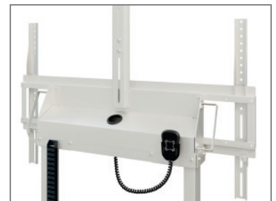
Cable management via cable drag chain