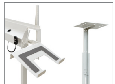
Extendable with laptop / camera holder